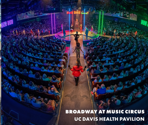
BROADWAY AT MUSIC CIRCUS UC DAVIS HEALTH PAVILION