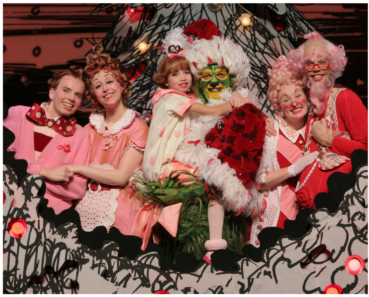
@ 2010 Grinch Company. Photo by: PAPARAZZIBYAPPOINTMENT.COM

This guide, designed to easily implement in the weeks before you attend the performance, provides jumping off points for discussion and suggested activities that you can adapt to the needs of your class. We have also included exercises to use after seeing the show to help you bring together all your class discussions from prior to the performance. Arts Education benefits every student by cultivating the whole person. In developing literacy, intuition, reasoning, and imagination into unique forms of expression and communication, students learn to see education and learning as fun and interesting throughout their lives. Founded in 1960, Group Sales Box Office is New York's leading theatre ticket company dedicated to serving your needs. Not only can we obtain the best price, we also have the best grasp of the needs of your group and your teaching goals. We hope this guide enhances your teaching experience and your students' enjoyment of DR. SEUSS' HOW THE GRINCH STOLE CHRISTMAS! THE MUSICAL.