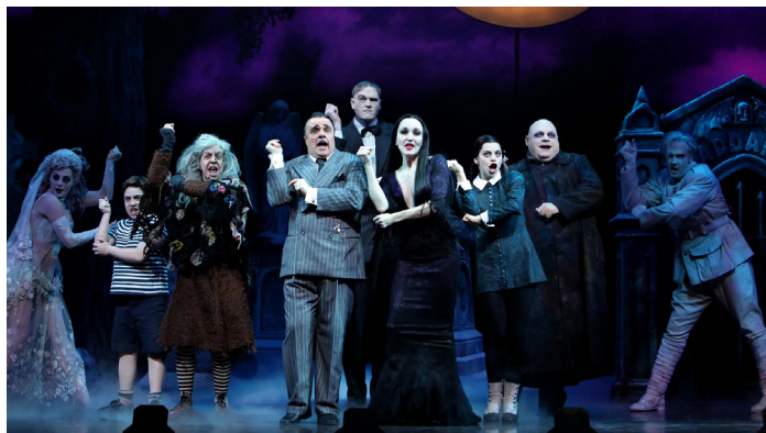
Original Broadway Cast of THE ADDAMS FAMILY.