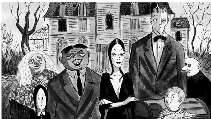
An illustration of the original Addams family by Charles Addams

In 1938, cartoonist Charles Addams published a one-panel illustration in The New Yorker depicting a vacuum salesman pitching his product to a spooky-looking couple in a cobweb-covered manor. The contrast between the everyday and the eerie was a common subject for Addams, who had made a name for himself with his off-kilter humor. This strange couple and their family quickly became a hit among readers, and they made recurring appearances in Addams' cartoons through the 1940s and 50s but remained unnamed.