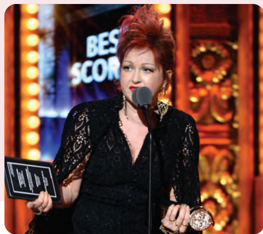
Cyndi Lauper accepting her 2013 Tony Award for Best Original Score.

The Tony Awards are widely considered the highest honor awarded in American theatre. When Cyndi Lauper won the Tony Award for Best Original Score in 2013 for her work in KINKY BOOTS , she became the first woman to win the award solo. To date, she is only one of seven to win and one of four to do so without a male writing partner. Check out these other notable women who have been recognized with Tony Award nominations for their songs: