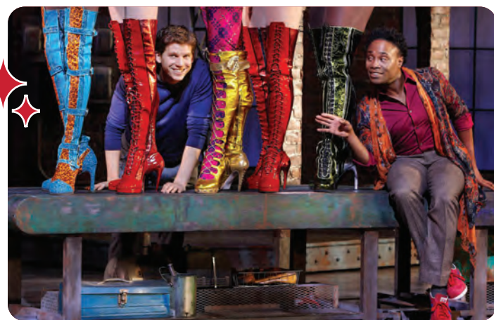
Stark Sands and Billy Porter in KINKY BOOTS